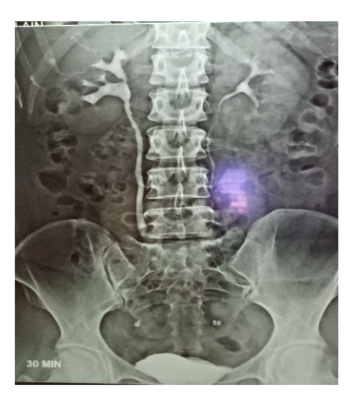
Fig 3. 30 min IVP film