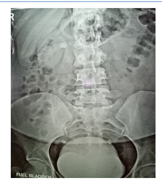
Fig 4. Full bladder IVP film