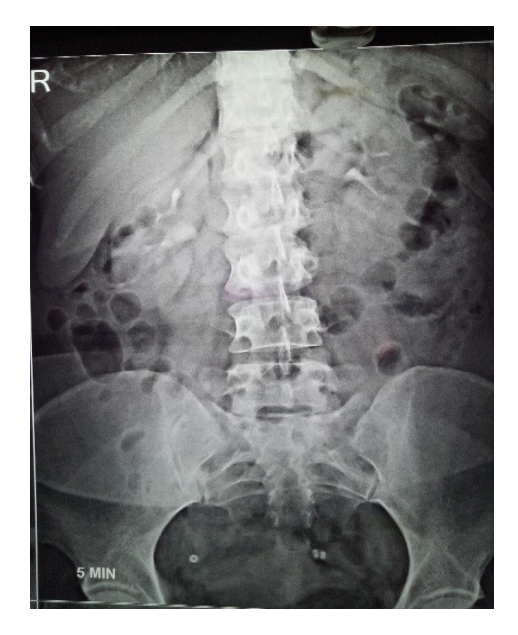
Fig 2. 5 Minutes IVP film.