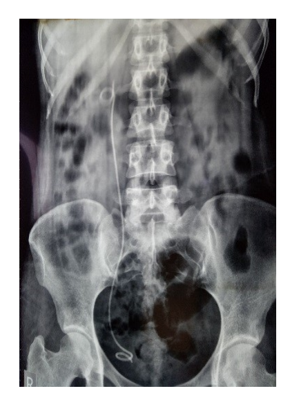
Fig 8. Group 2: DJ lithotripsy group, Post-operative film showing DJ stent in situ and complete clearance