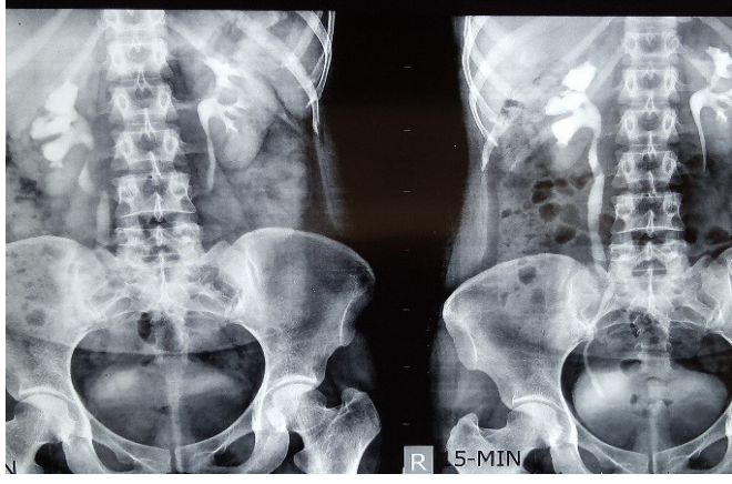
Fig 7. Group 2: DJ lithotripsy group, IVP films

Narendra et al. ■ Comparative study of lithotripsy and miniperc in 11 to 18 mm impacted PUJ calculi.