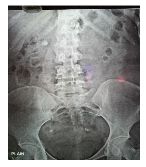
Fig 1. Plain x-ray KUB.