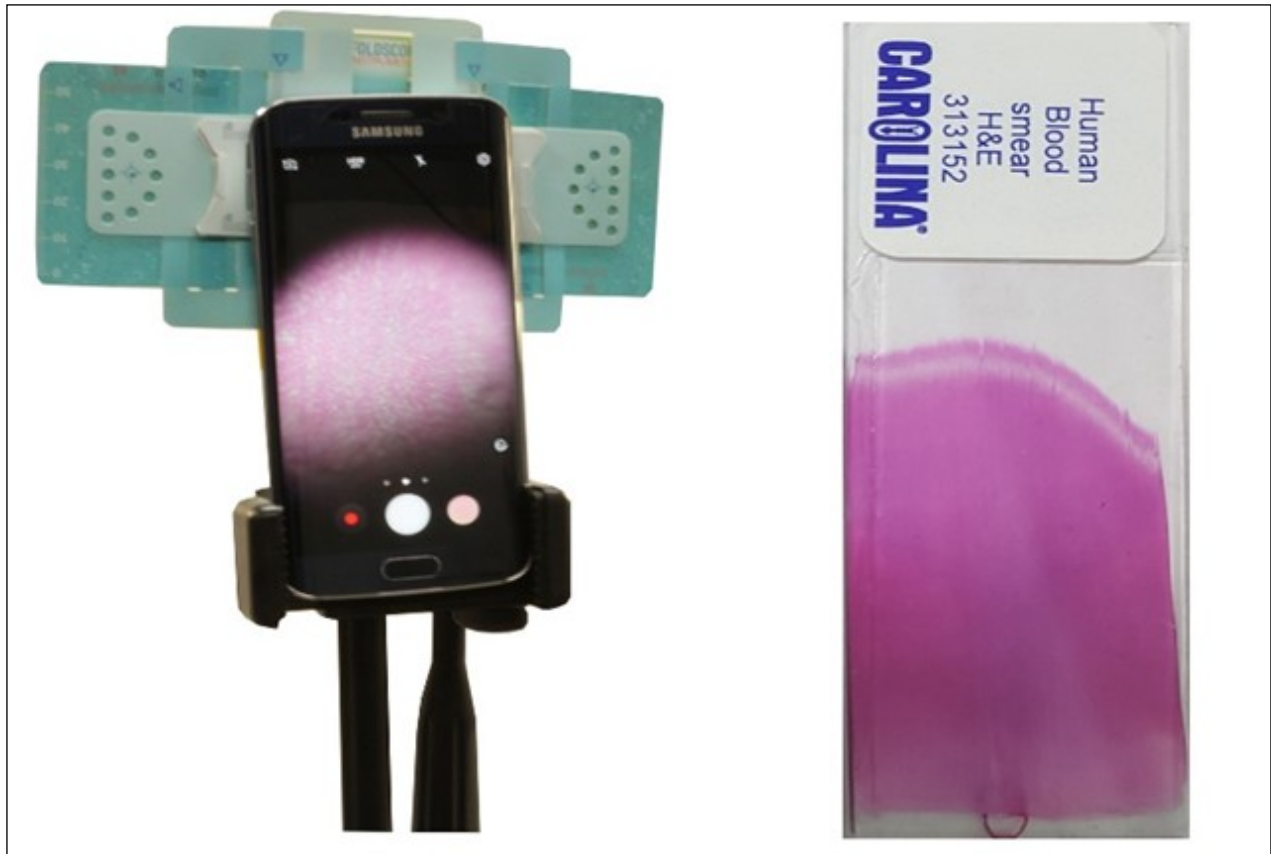
Figure 1. (a) Foldscope with Smartphone

rectangular grid on the Foldscope obtained images and afterward it was possible to count that how many cells are present in each grid, for example- 7 blood was found in the lower right grid (Figure 3a). This process of cell counting might be complicated because it needs to spend the time to draw grids, hence we tried to process the image in ImageJ software. We used color balance and threshold option to process the image. After this image processing, the blood cells were clearly appeared on a white background and easily could be counted (refer to figure 3b).